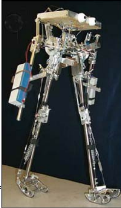
The batteries are in the arms

The third robot, developed at the Massachusetts Institute of Technology (MIT), has been nicknamed the Toddler on account of its walking style. It uses neural networks to learn - adapting its movement according to the terrain it is on.