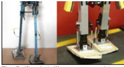
The Delft robot (l) uses gas canisters; MIT's (r) is nicknamed the Toddler